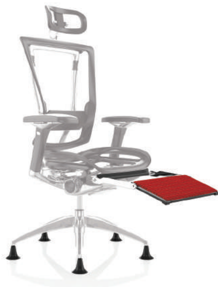
LEGREST / BLACK GLIDES