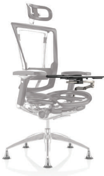
NOTEBOOK STAND / POLISHED GLIDES